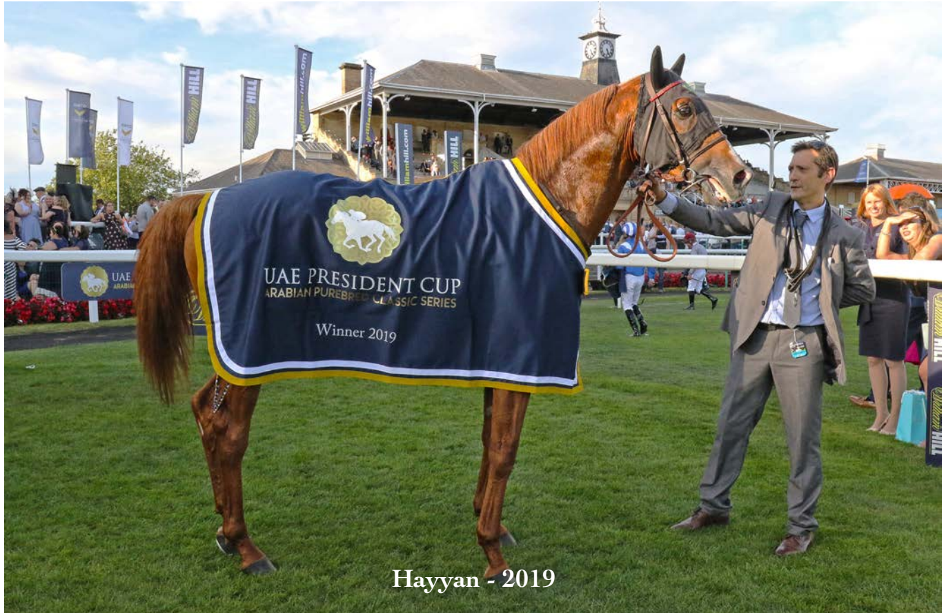
Hayyan - 2019